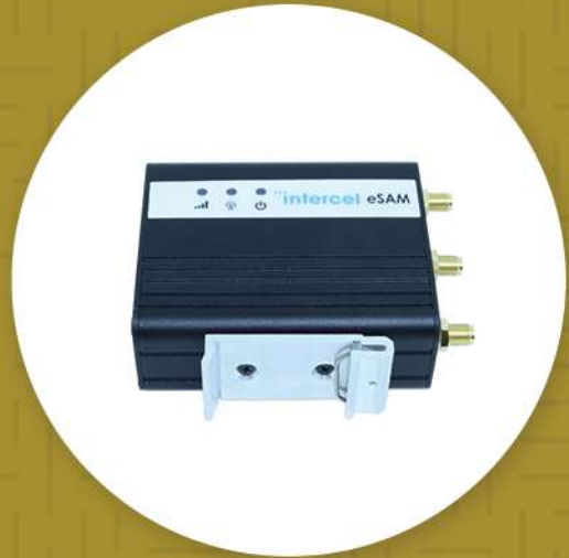
35mm Din-Rail Clip